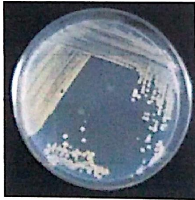
Fig 1:- colonies of nitrogen fixing bacteria