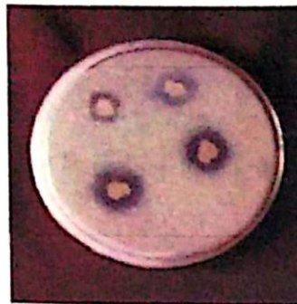
Fig 2:- colonies of phosphate solubilizing bacteria